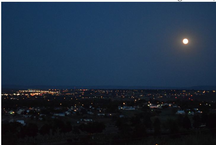
From Moon Rise Sequence - Chuck Cram

I find myself often frustrated that I never have "enough" time, things always take longer than I think they should, and there is an impact that happens as a result of time deadlines that shift the important things into secondary status because they seem less urgent than